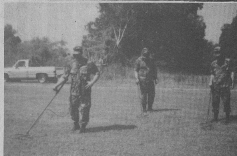
Workers with metal detectors scour the ground for rectangular shapes that would signify a grave.